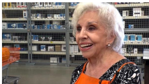
100-Year-Old Woman Who Still Works At Home Depot Has Tips For A Long Life

Suite 7, 7 Convent St. North Sydney, ( 902) 322 -7232